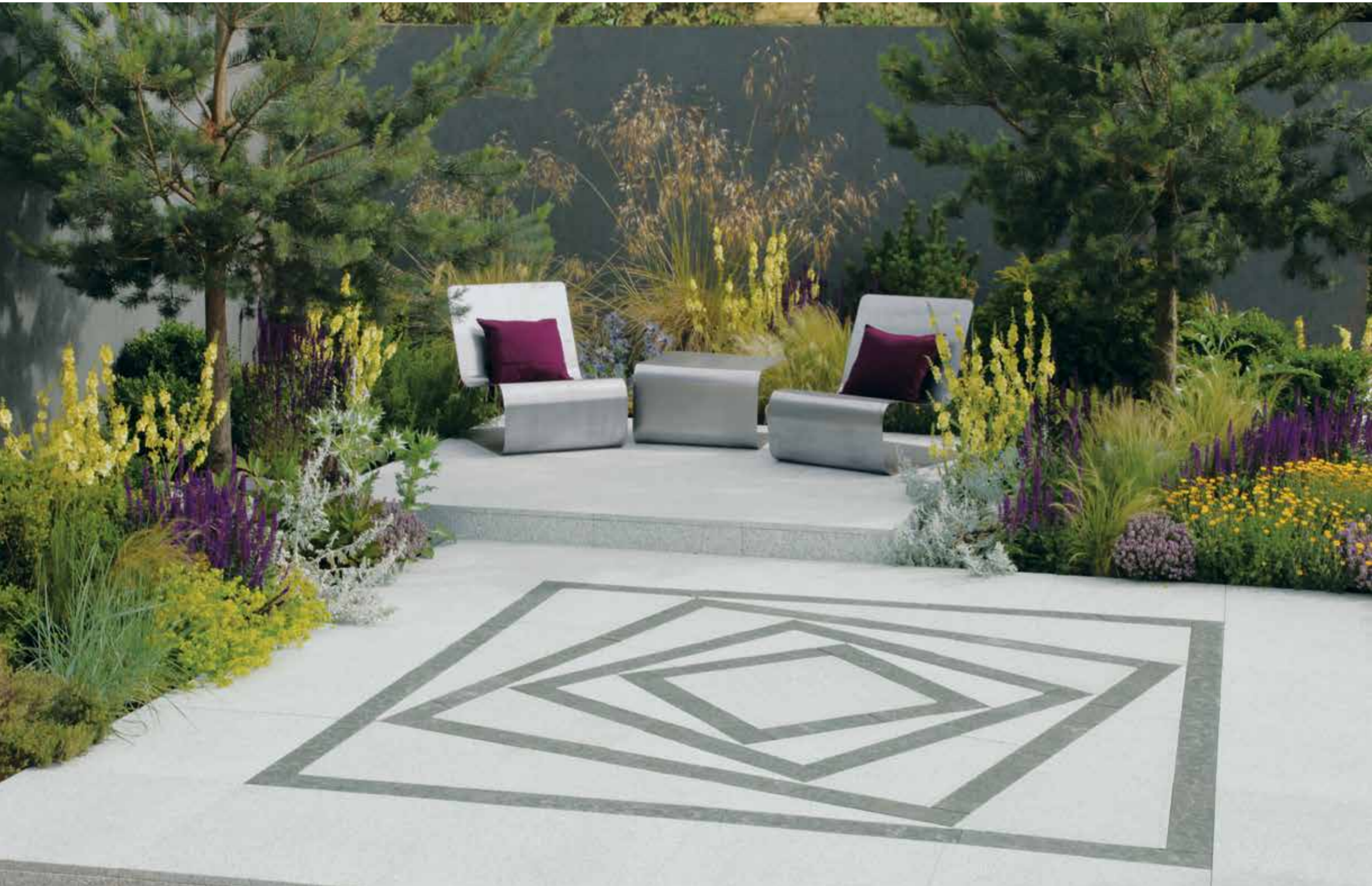
Arctic Granite Revolve with Arctic Granite, Glacier