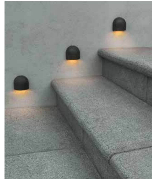
Arctic Granite Step, Dusk