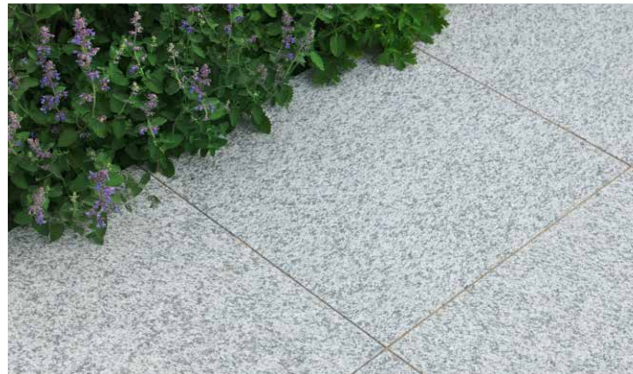
Arctic Granite, Glacier