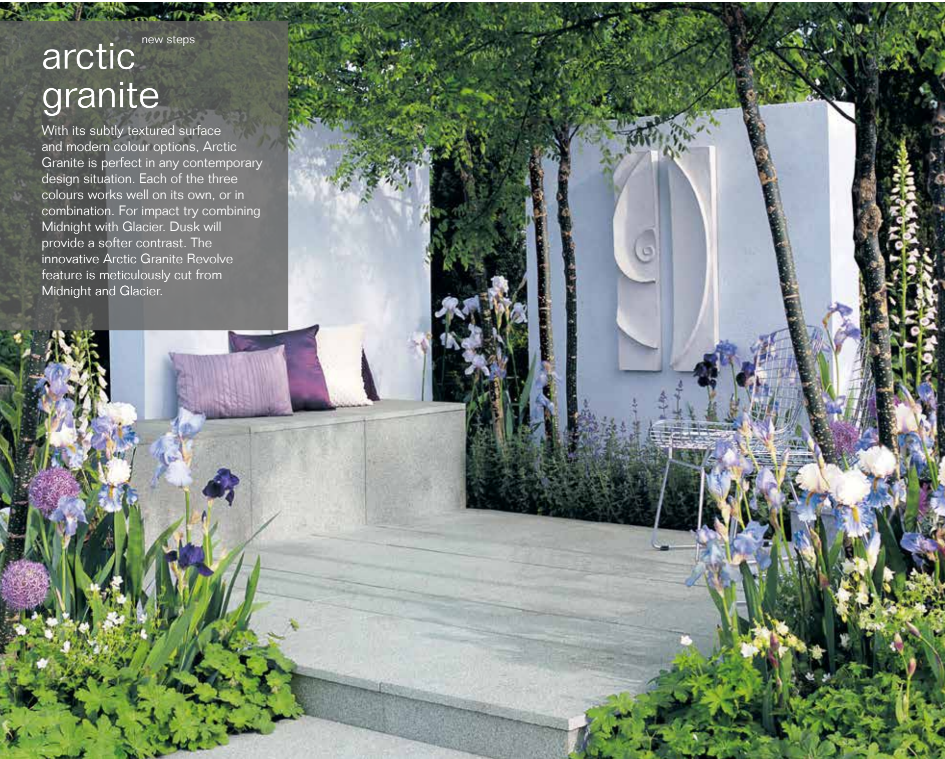
Arctic Granite, Glacier

With its subtly textured surface and modern colour options, Arctic Granite is perfect in any contemporary design situation. Each of the three colours works well on its own, or in combination. For impact try combining Midnight with Glacier. Dusk will provide a softer contrast. The innovative Arctic Granite Revolve feature is meticulously cut from Midnight and Glacier.