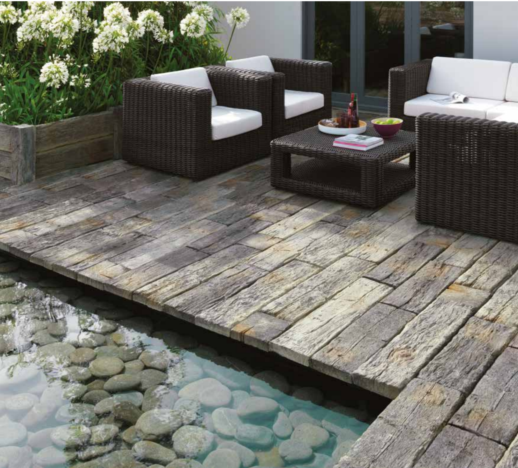
Driftwood Sleepers and Setts, with Intermediate and Corner Posts. Pacific Paddlestones lining the base of the pool, see page 97