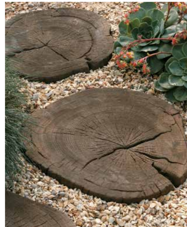
Sleepers and Setts, Coppice Brown