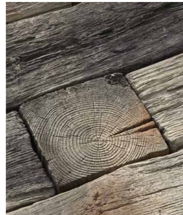
Driftwood Sleepers and Setts,