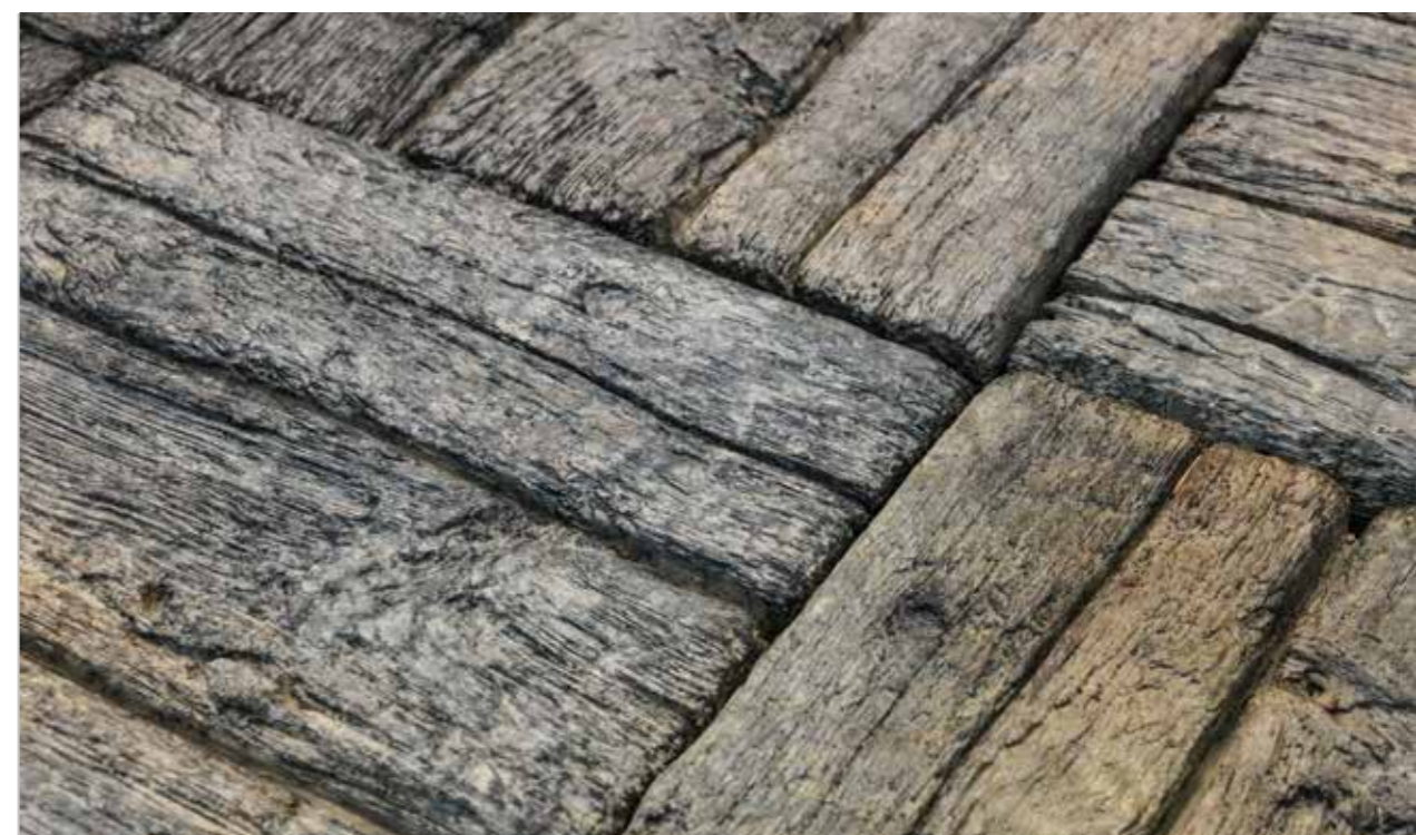
Timberstone Decking, Driftwood